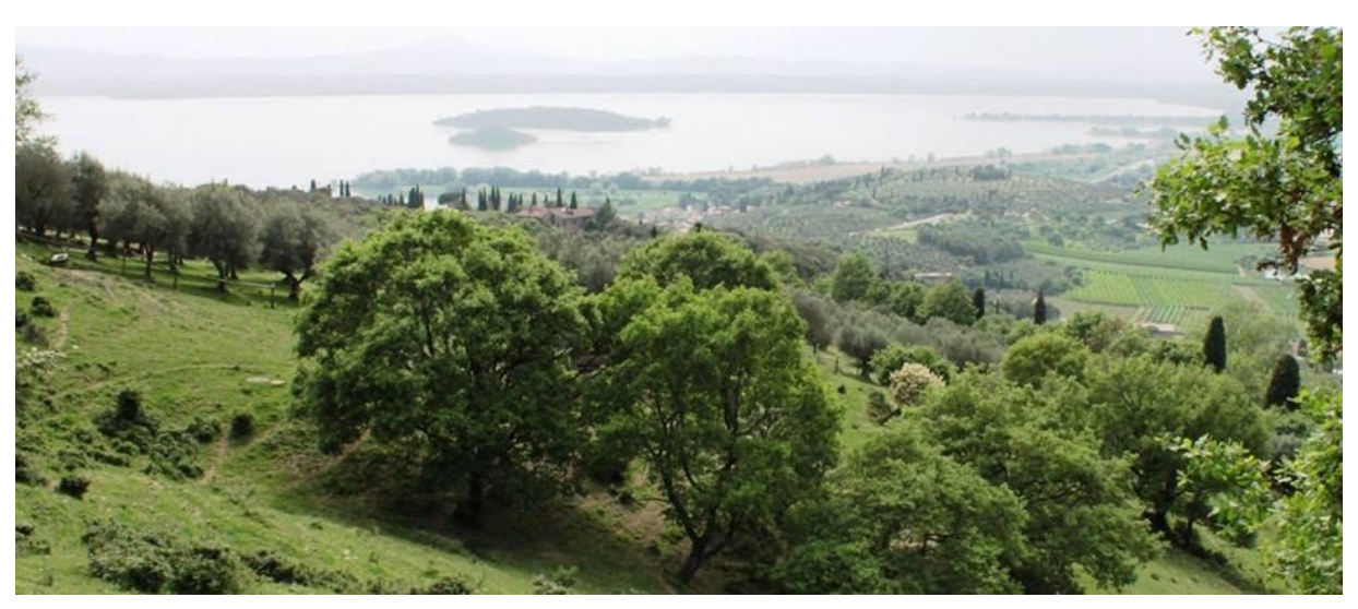
Figure 1 - The view from the farm on the Trasimeno lake.

The address of the farm is: Via Campagna 26, 06065 Passignano sul Trasimeno, Italy.